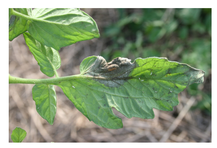
Figure 2: Fruit affected by late blight exhibit darkened, water-soaked spots.

The last time late blight was influential in Kentucky was during the 2009/2010 seasons, and systemic fungicides targeting this disease are not a routine part of tomato/potato spray programs. Thus, most commercial growers will want to adjust their program if Kentucky crops are affected by late blight.