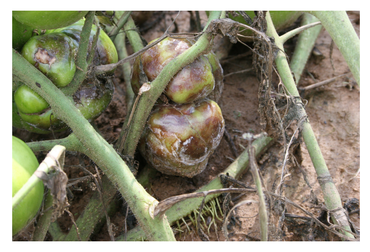
Figure 1: Late blight leaf lesions begin as water-soaked areas that quickly enlarge.

Late blight has been positively identified in eastern Tennessee and has the potential to affect tomato and potato crops in Kentucky. Under wet conditions, this disease can completely destroy an otherwise healthy planting in about 2 weeks. Leaf lesions begin as water-soaked areas that can enlarge quickly (Figure 1). Fruit affected by late blight exhibit darkened, water-soaked spots (Figure 2).