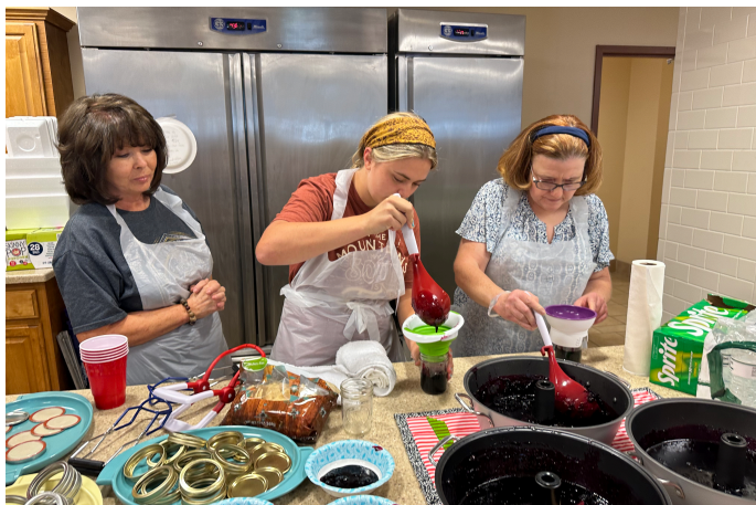
Canning After a Disaster Participants