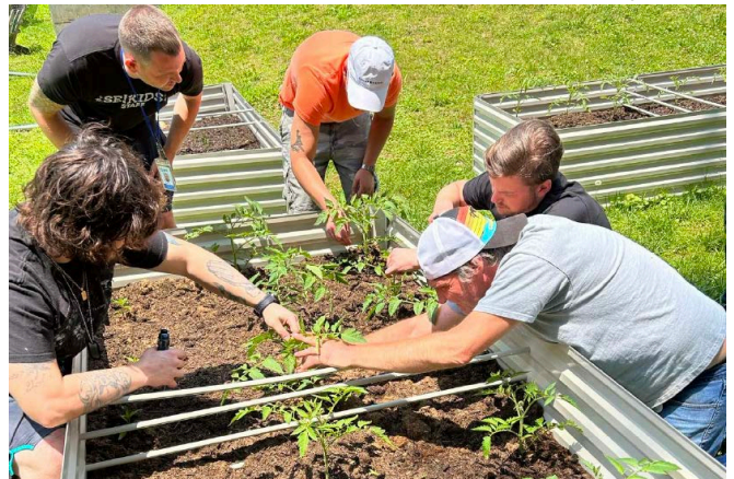
Recovery Garden Participants

It was a great form of exercise and a mental health break for them. Many said it brought back good memories of helping their grandparents raise a garden, and made them want to raise their own someday.